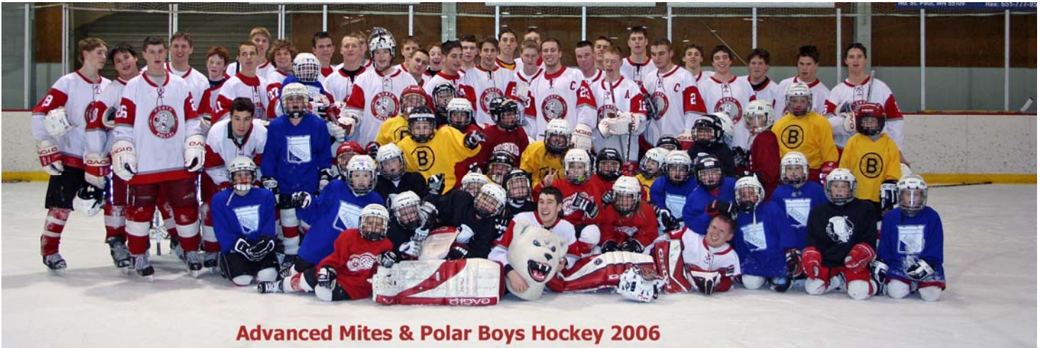
Advanced Mites & Polar Boys Hockey 2006